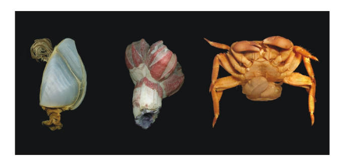
Figure I Representatives of Cirripedia. From left to right: a goose barnacle (Thoracica, Lepadidae); an Indo-Pacific giant acorn barnacle (Thoracica, Balanidae); and the externa of a parasitic Sacculina (Rhizocephala) sitting under the abdomen of a crab.

than a hundred years exclusively by its larval stages. With this study, the authors approach the solution of one of the last major riddles of the complex biology of thecostracan crustaceans, which has puzzled numerous zoologists over the past two centuries.