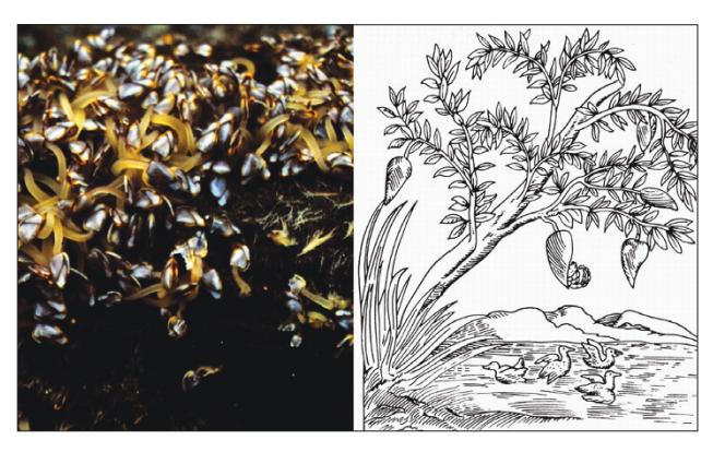
Figure 2 Barnacles as early stages in the life cycle of geese. Left: goose barnacles attached to a drifting log. Right: medieval view of the 'goose tree' producing geese of the genus Branta from barnacles.

Barnacles, and this is true for Cirripedia and their kin in general, are one of those groups whose phylogenetic position has only been resolved by the recognition of their life cycle. The details of cirripede ontogeny were for a long time entirely unknown, although some speculations existed, the most curious of which was that barnacles represented early ontogenetic stages of geese, probably the Brent Goose